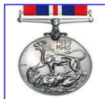
1939-1945 War Medal